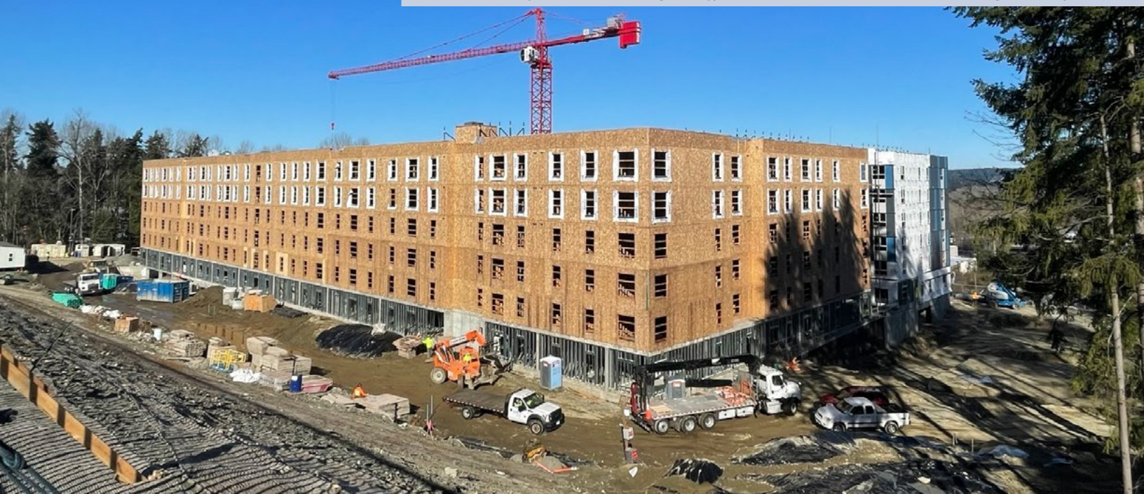
Construction of Polaris at Eastgate affordable income-restricted housing (now open)

The city supports the Association of Washington Cities' 2025 legislative agenda items that serve the best interests of Bellevue.