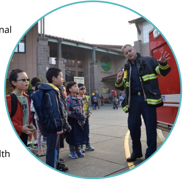
Firefighter speaking to students at Somerset Elementary School