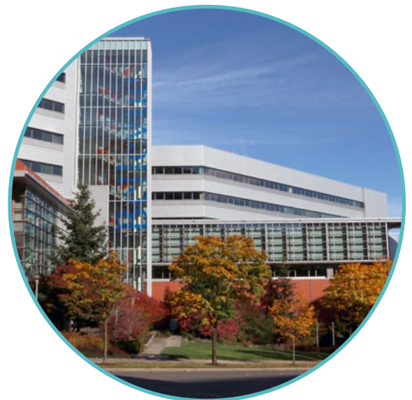
Bellevue City Hall