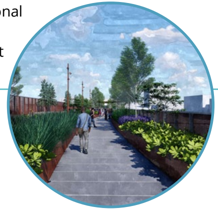
Rendering of the Bellevue Grand Connection crossing I-405

This project would improve the safety and accessibility of the public gathering space at Bellevue’s City Hall Plaza for more than 40,000 people each day. When the Bellevue Grand Connection I-405 Crossing is complete, it will connect light rail to Eastrail and the bicycle and pedestrian network throughout East King County. Capitalizing on the regional investment of Sound Transit’s 2 Line, this project is critical in preparing for the arrival of the Grand Connection I-405 Crossing, future bus rapid transit lines, and new public facilities near City Hall.