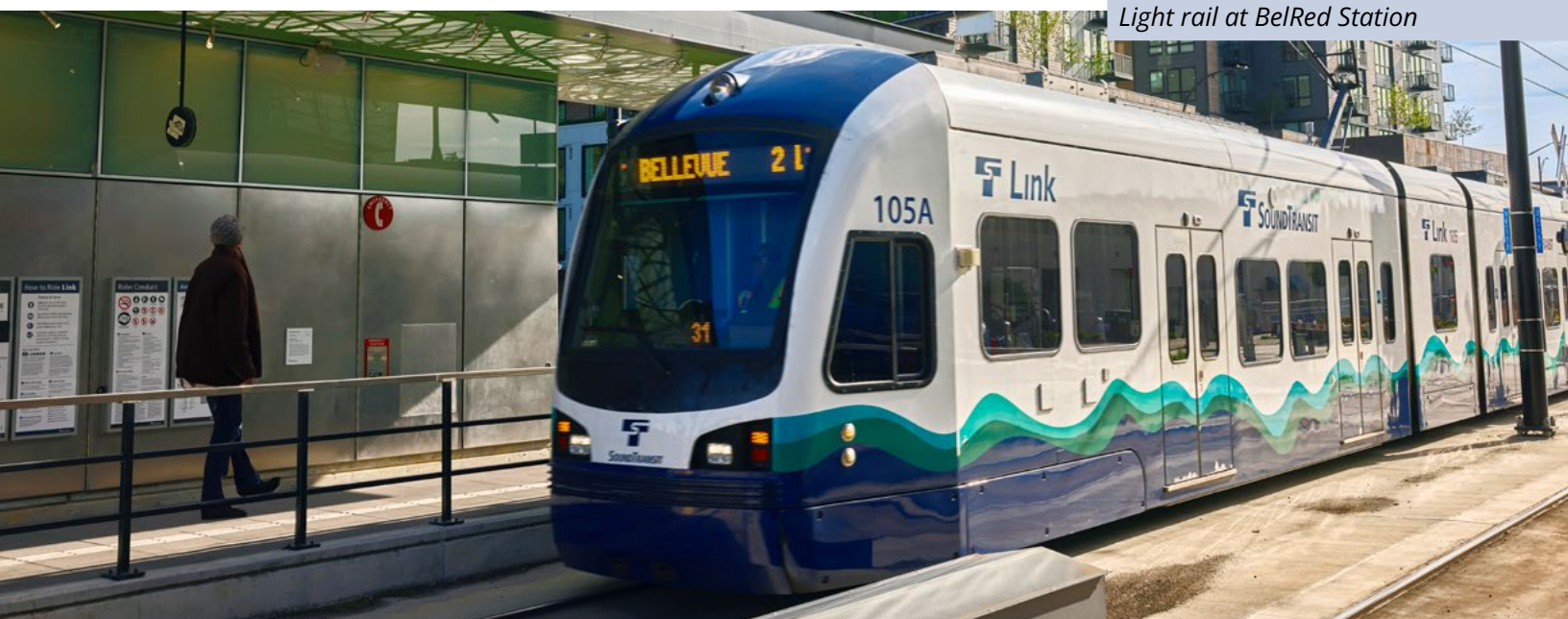
Light rail at BelRed Station