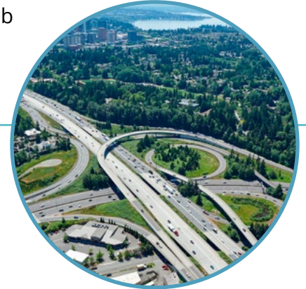
Aerial of I-405 and the SR 520 Interchange

One of the most congested and unsafe interchanges in East King County, this project will reduce congestion on both I-405 and SR 520. This project will improve safety and access to medical facilities and the Spring District – an urban neighborhood and job center connecting to light rail and regional trails. The SR 520/124th Avenue NE Interchange project is at the end of the preliminary engineering phase and is envisioned as a design-build contract.